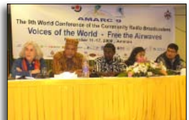
MENA Conference, Amman 2008

Bogota International Conference CR for a Better World (February 28-29). AMARC LAC Board and representatives from the region came together to assess the situation of CR in the region and to define plans of actions and programmes for 2007-2008.