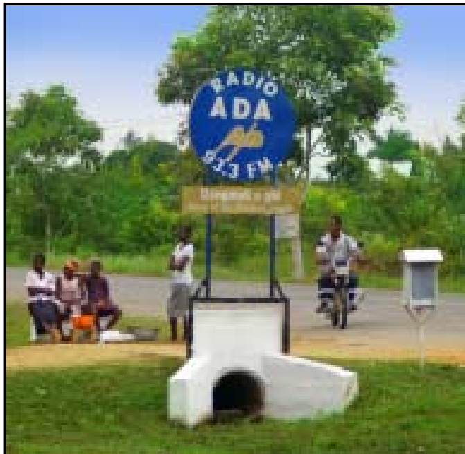
Radio ADA, Ghana

World Association of Community Radio Broadcasters, AMARC