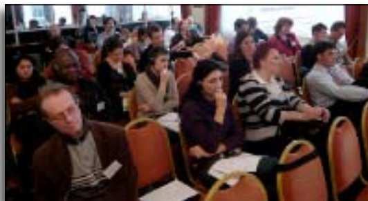
Amarc Europe Conference, Bucharest 2008

Community Radio activities in 2008 will be under the sign of the 25th Anniversary of AMARC. AMARC members and Community Radio Stakeholders organized several activities to celebrate, reflect on lessons learned and discuss on how to strengthen the social impact of Community radio to combat poverty, exclusion and voicelessness and to promote social justice and sustainable, democratic and participatory human development.