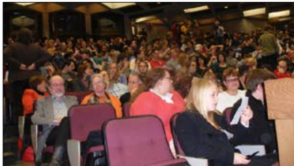
Simposium AMARC, Montreal, November 2008

The result of these and other activities was the increased awareness throughout the community radio movement and of community radio stakeholders on the importance of action-research on impact assessment of community radio in development and reflections on how to increase, quality, content pertinence and participation in CR.