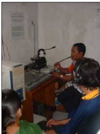
Making Radio in Jakarta

The 25th Anniversary were important to AMARC, in allowing to explore the added value by a world Association of grassroots community radios, to the radio movement and to civil society by giving voice.