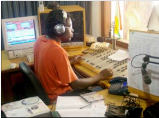
Radio ADA, Ghana

Advocacy activities were conducted in 2008, particularly in relationship to UNESCO for the 3rd May International for the freedom of expression in Maputo, where the declaration explicitly recognised the role of