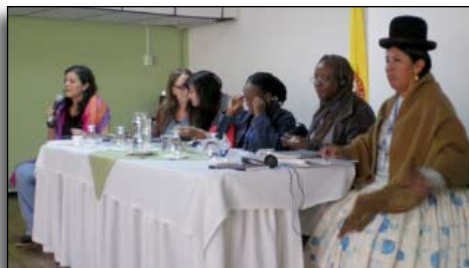
25 Anniversary, Bogota International Conference, Colombia

More specifically, the Conference "Community radios for a Better World" held in February, in Bogota (Colombia), permitted reflection on how to increase