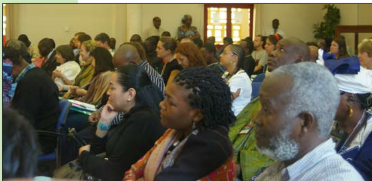
Ghana, August 2008

This 2008 report concerns the performance of AMARC in regards to the objectives of the plan of action for 2008. It concerns the activities organized by the International Secretariat or executed in AMARC regions with its support through the harmonisation process between the AMARC political and institutional bodies.