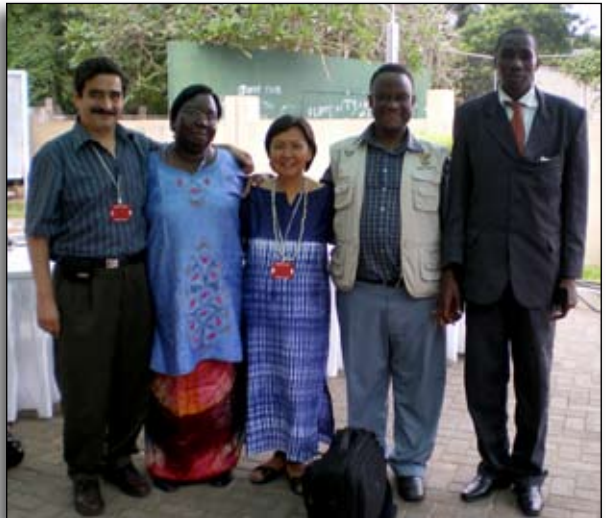
Accra, Ghana, August 2008 - (Photo: Amarc)

Second, the knowledge sharing and capacity building committee met in Accra Ghana, in the context of the Our Media 7 Conference to clarify and define knowledge and training needs of local CR in order to increase the sustainability of AMARC members and to ensure content exchange and to amplify the voices of the poor and excluded.