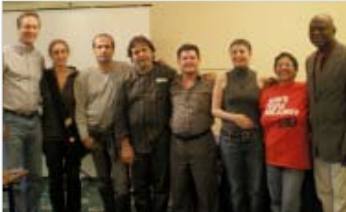
New European Board of Directors

AMARC held a knowledge sharing and capacity building conference in Bucharest, Romania. CR in Europe: