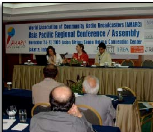
AMARC, Asia Pacific Regional Conference, Jakarta, Indonesia, 2005

the lines laid down at the Dakar Conference, allowing the organisation to cross three new frontiers: the legal frontier, by discussing new international law's recognition of community media; the technical frontier, by helping members to meet technological challenges and by enabling community radio collaboration with other media with a similar vocation; and, the geographical frontier, by making a breakthrough into Asia and the Arab countries.