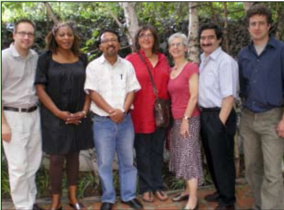
BCO Meeting, South Africa 2008

AMARC has reinforced its partnerships for development and democratisation; it has reinforced its harmonisation process thus increasing the effectiveness of its network; It has also reinforced the communication processes throughout the network. There has been an important work of processing the CR social impact assessment results and disseminating the information particularly in the Bogota, in Accra, in Indonesia and in Montreal.