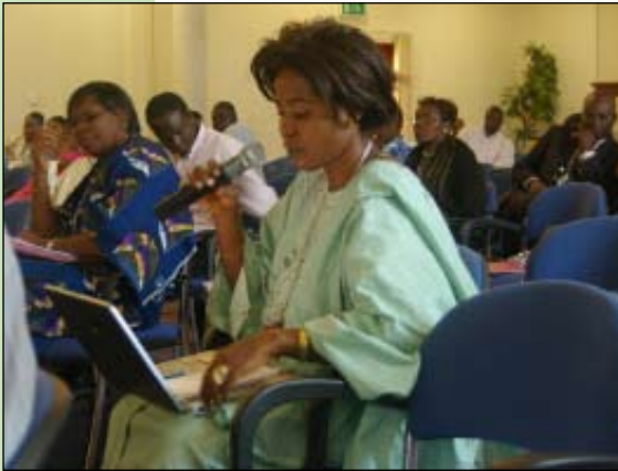
Ghana, Africa, 25 Anniversary Conference

As other action committees set up by the international board, the capacity building committee is intended to facilitate members' participation to ensure implementation of the objectives of the 2007-2010 Strategic plan, as well as to review the knowledge sharing and capacity building activities and to make recommendations that facilitate the pertinence and the effectiveness of AMARC interventions.