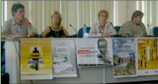
25 anniversary, Amarc Africa Conference, Ghana 2008

A second challenge relates to giving access of the excluded and marginalized to the media to speak and produce relevant content. Relevant content, based in local knowledge, culture and languages has been recognised as a key breakthrough of the community radio project. The impact of the message suffers when it is expressed in poor quality programming, on insufficient use of appropriate radio techniques and formats to convey a message; particularly when it tries iteration or copy of other