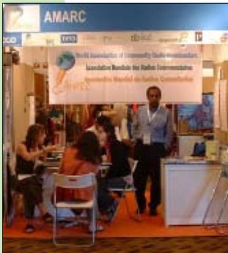
BCO Meeting, South Africa 2008

See http://evaluation.amarc.org/evaluation.php