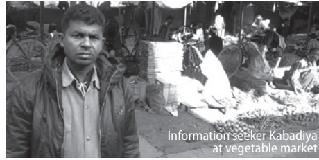
Information-seeker Kabadiya at vegetable market

In view of the growing complaints of the locals against the vegetable market committee, Maiphujur had sought the information.