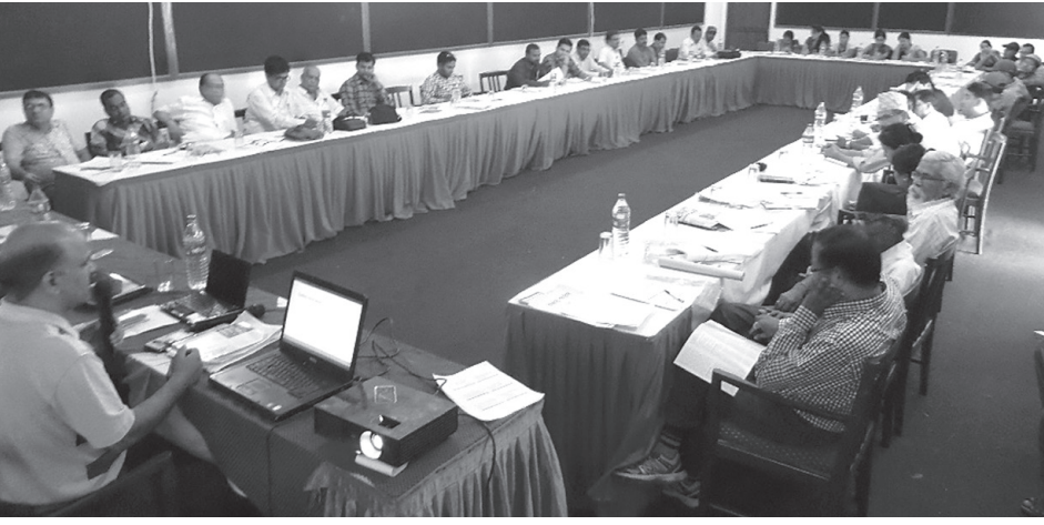
Media owners and professional organizations participating in a dialogue on journalist safety protocol in Biratnagar on July 30

Similarly, in the level of policies and practices, the following were suggested: