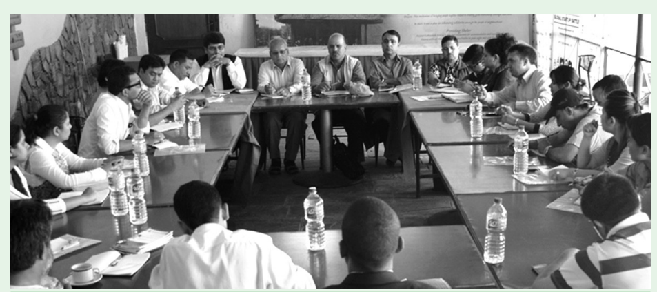
Stakeholders discussing RTI and management of crisis information

Nepal witnessed a huge loss of lives and destruction of properties in the recent earthquakes – the major one striking the