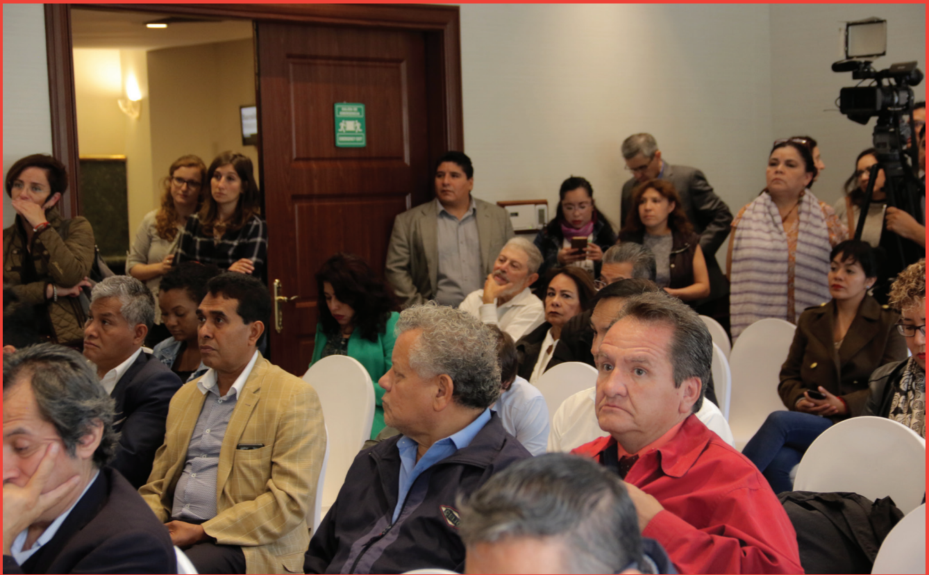
Journalists and media representatives during the round of questions at the Mission's press conference. November 6th, 2019.