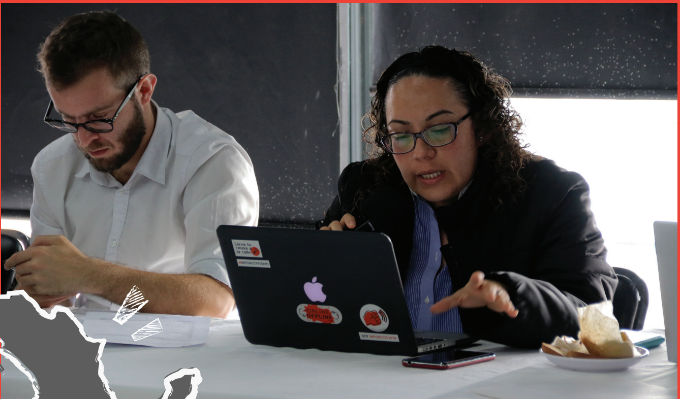
Mexican journalists in reunion with members of the Mission. November 4th, 2019.