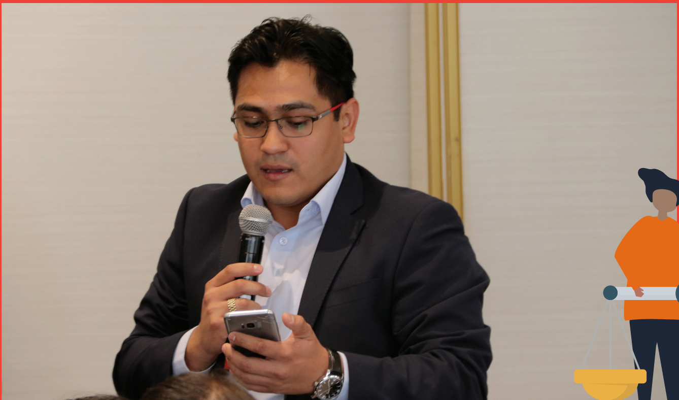
Journalists and media representatives during the round of questions at the Mission's press conference. November 6th, 2019.