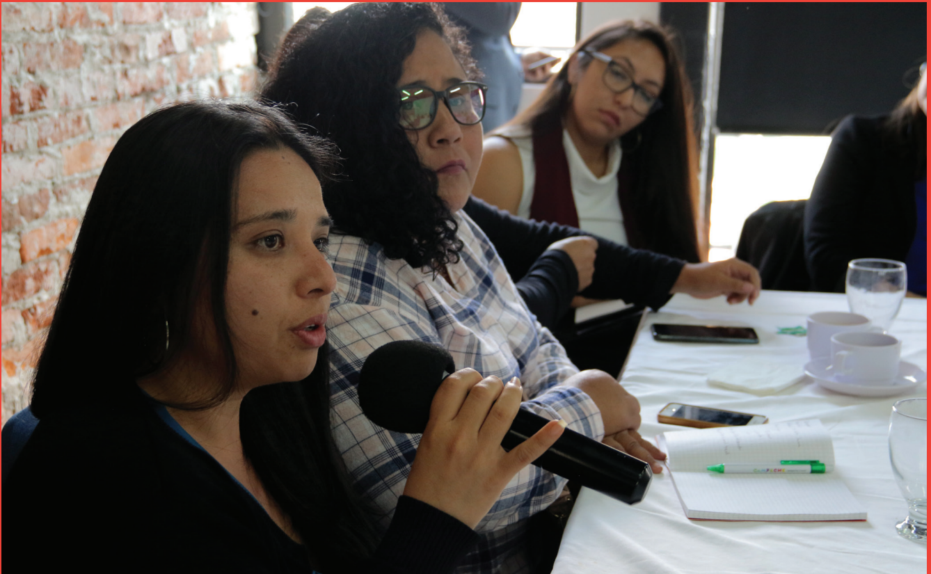
Mexican journalists in reunion with members of the Mission. November 4th, 2019.